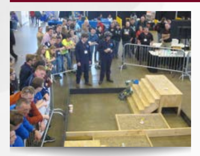
Chippewa Local Schools students participate in Robotics Competition