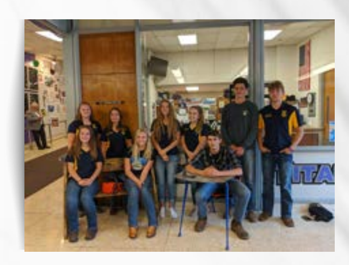
Triway Local Schools students in the Agriculture Education Class present information at the Fall Advisory Team Meeting