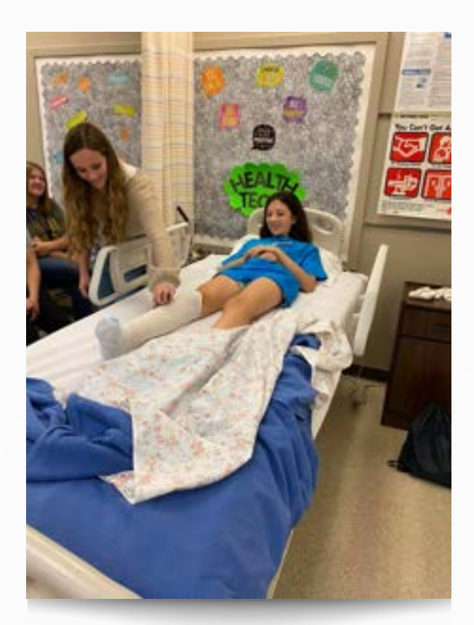
Sixth grade students experience different trades at the Ashland County - West Holmes Career Center "Guys with Gloves & Girls with Goggles" event